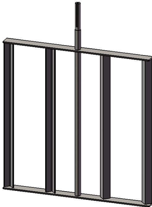
OPTIONAL "PICKET FENCE" IMPELLER