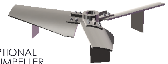
OPTIONAL AF3 IMPELLER