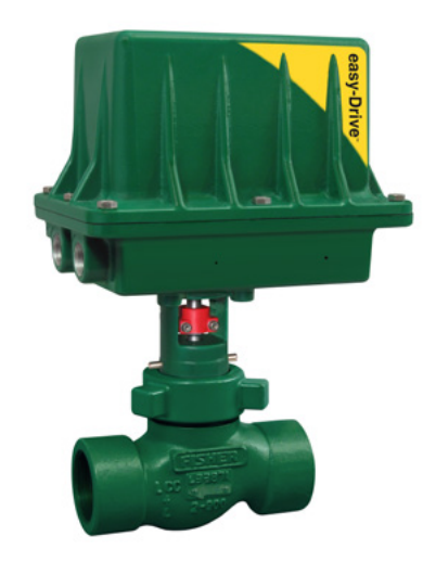
Fisher™ easy-Drive™ Electric Actuator on a D3 Valve

With the Fisher easy-Drive electric actuator, you can achieve more reliable control without the product waste. It has been designed to let you set it and forget it, based on extensive field testing and application expertise. Connect it to your existing Modbus network and remotely track the health of your wellhead at all times, without sending personnel to the field.