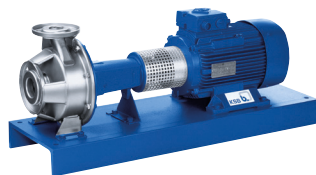
Etachrom L with motor